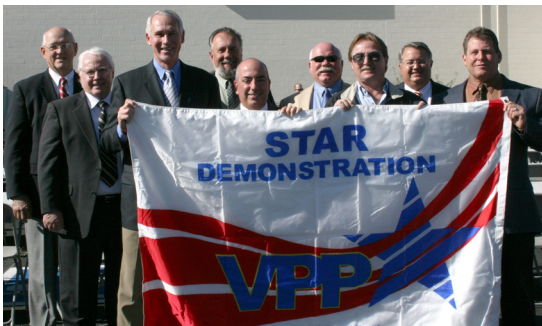
Initial award of STAR status in 2008

Sturgeon Electric Company, Inc.'s (Sturgeon Electric) Colorado district, a subsidiary of MYR Group Inc. (MYR Group) is proud to announce its continuation of STAR status in OSHA's Voluntary Protection Program (VPP) Mobile Workforce Demonstration for Construction for 2013! Sturgeon Electric was initially awarded STAR status in the program in 2008, which it has continuously maintained year over year. STAR status is the highest VPP recognition level awarded by OSHA for workplace safety and health, and demonstrates Sturgeon Electric's commitment to lead the industry in occupational health and safety and continually advance initiatives to improve the lives of employees.